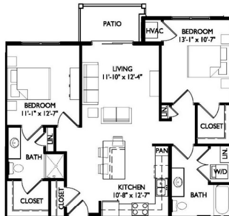
Typical 2 Bedroom