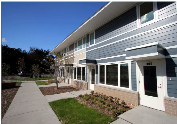
Axley Place Entrances

Department of Commerce and Economic Opportunity as well as North Suburban Housing Corporation.