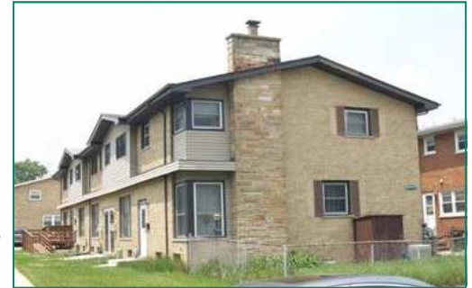
Prospect Townhomes, Niles

Working with HUD, we were able to help save this supportive housing project for persons with disabilities. Due to state funding cuts the property was headed towards foreclosure but HODC was able to take ownership of the four 3 bedroom townhomes that serve twelve people with disabilities. HUD renewed the rental assistance contract for 20 more years so rents will be kept affordable for residents. HODC staff completed repairs and clean-up prior to move-in. HODC is providing property management and is partnering with Thresholds who provides case management services to resident members. One unit has an elevator and entrance ramp for accessibility and the bedrooms have deaf/hard-of-hearing features.