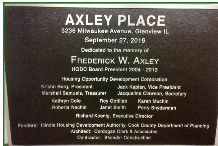
Axley Place, Dedication Plaque