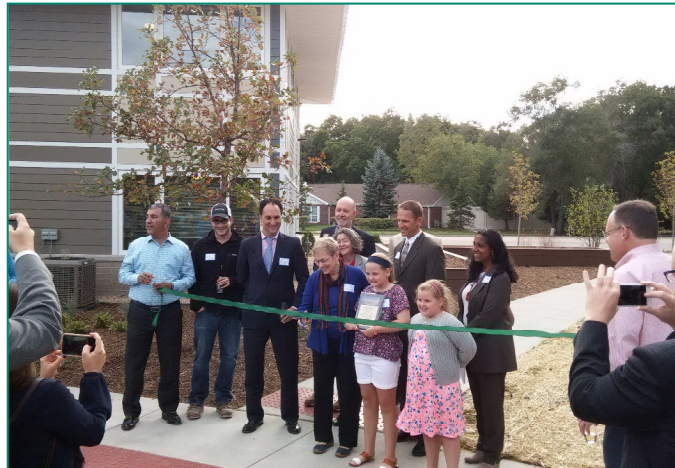
Axley Place Ribbon Cutting

HODC celebrated the Grand Opening of Axley Place on September 27! The ribbon cutting was attended by Axley family and friends, elected officials, funding agencies and potential tenants.