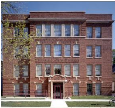
Claridge Apartments, Evanston