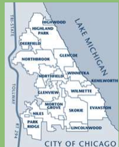
HODC's primary service area