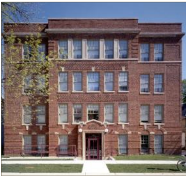
Claridge Apartments, Evanston