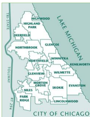
HODC's primary service area