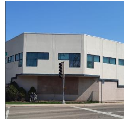
HODC's new building at 5340 Lincoln Avenue, Skokie, IL 60077

We Moved! Like those we serve, HODC faced a housing crisis of its own in 2020. The space HODC has rented for 15 years was no longer going to be available. Fortunately, HODC was able to move into a temporary space at The Community House in Winnetka as HODC's board and staff searched for a permanent solution. HODC closed on our first-ever corporate home in November. The purchase of 5340 Lincoln Avenue in Skokie places our staff in a central location to our rental properties, and provides space for expansion while controlling our operating costs.